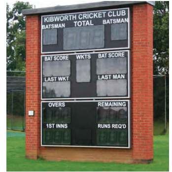
What we're aiming for We want one of these at Shepshed

Instead, stay on and have a drink with your mates and watch our very own lottery.